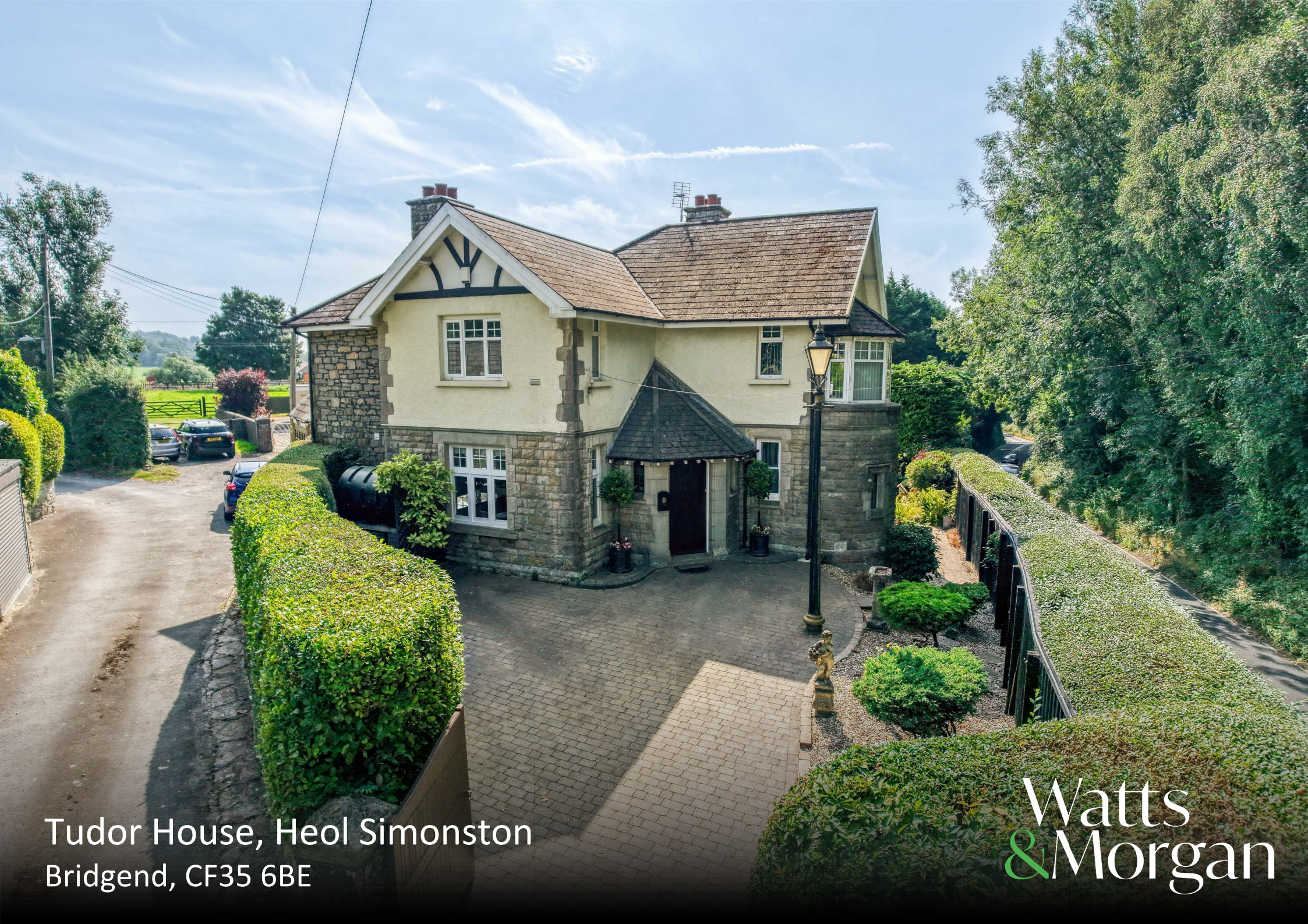
Tudor House, Heol Simonston Bridgend, CF35 6BE